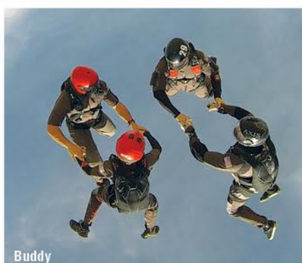
Clone position during Buddy